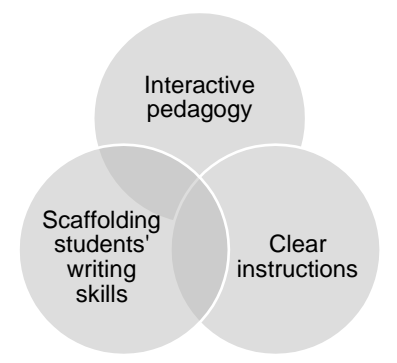
Figure 3 Solutions to overcome SLWA among ESL students in the public university.

In terms of pedagogy, engaging, student-centred and interactive pedagogy was the most preferred solution. A total of 79.6% (n=82) preferred hands-on training on writing to be conducted regularly, while another 62.1% (n=64) chose to have more group work for writing practices. 76.7% (n=79) also preferred classes to be more fun, current and trendy. A total of 80.5% (n=83) of the students suggested real, situational-based learning activity help to overcome SLWA. Hence, the lecturer/teacher may adopt other methods such as task-based or problem-based approaches, when choosing the topic for writing. Students should be encouraged to use the target language authentically to complete the given tasks or to solve the given problems.