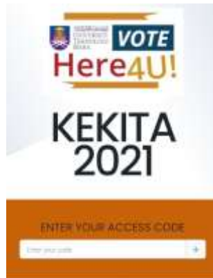
Figure 2: User Login Page

Figure 3 below represents the system architecture that indicates the module and the flow of the processes involved in the system. Generally, the voter will directly interact with the online voting module and the voting result module can be accessed by the administrators and the election committee. In addition, this e-Voting comprises the voters' and candidates' information in the database, while the votes, calculation of the total number of votes and the results will also be stored in the database. A few of the security features of the system are: