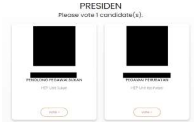
Figure 1: The System's Interfaces