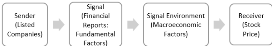
Figure 2 Theoretical Framework

Nine specific hypotheses could be generated based on Figure 2. The hypotheses are stated below: