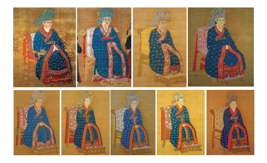
Figure 2: A Sitting Statue of the Empress of the Song Dynasty in Nanxun Hall (Taipei)

Comparing with the regulations of the empress's Hui Yi (祎衣) of the Song Dynasty, combined with the styles, colours, patterns and accessories shown in the portraits, it basically fits with the public service system, and it can be determined that they are wearing ceremonial costume Hui Yi (袆衣). The nine-empress painted in the portrait (Figure 2) are all sitting upright, wearing a crown of dragons, phoenix, and flowers on their heads, wearing deep blue sleeves, and decorated with Di (翟) bird patterns all over (Zhang, 2019). The top style is cross-collar right gusset, sparse and wide sleeves, decorated with cloud and dragon patterns on the collar, sleeves and placket, and a belt around the waist. In addition, the portrait also shows some details that are not reflected in the literature, such as the empress's Hui Yi (袆衣) of the Song Dynasty all dark blue, but there are different degrees of colour difference. There is no description of the decoration on the back crown in the literature, but it is very clearly reflected in the portrait. The Di (翟) bird pattern on the belt is not three lines, but denser. This article analyzes the religious elements in the styles, colours, patterns, and accessories of the empress's Hui Yi (袆衣) of the Song Dynasty based on the mutual corroboration between historical book materials and images.