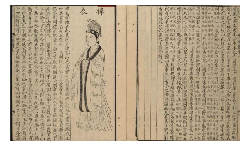
Figure 1: The Images and Written Records of the Empress's Hui Yi in the Painting of San Li Tu

and soil. The ceremonial costumes tended to be red and yellow, and no longer advocated black. Therefore, they chose blue Hui Yi (祎衣). The Song Dynasty belongs to fire, and to inherit the previous dynasty, it also uses blue.