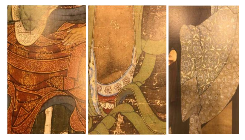
Figure 6: The Details of Falun Patterns on the Clothing of the Characters in Buddhist Portraits

consistent with the small Falun (法轮) flower pattern on the Empress Hui Yi's (祎衣) costumes, which shows the importance of Buddhism in the Song Dynasty.