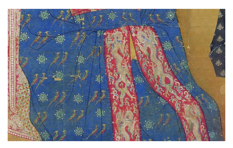
Figure 3: The Di Bird Pattern in the Hui Yi

power and a symbol of dignity. At the same time, Di (翟) bird has five colours which symbolizes the virtue of the empress. The five colours are blue, red, yellow, white, and black. They are the most orthodox colours in traditional Chinese Confucianism. Other colours are counted as variegated colours. The orthodox colours and the intermediate colours indicate the symbol of respect and inferiority and the rank of noble and inferior. The Di (翟) bird pattern in the Hui Yi (祎衣) uses the five orthodox colours to express the noble status of the empress (Figure 3).