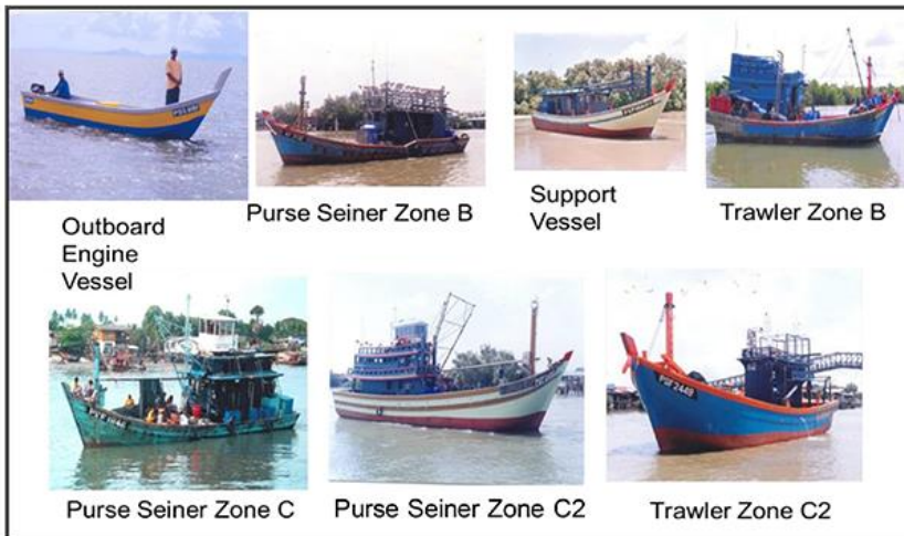
Figure 2: Types of fishing vessels in Malaysia and Sarawak.