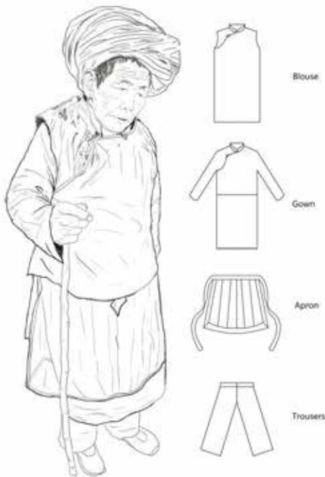
Figure 3: Lanping Type Portraits and Pattern of Lisu costumes

Samples No. 7-12 belong to the second costume type. The costume features are as follows: wearing black headcloth or black/blue Service hat; wearing a blue Blouse inside the upper body, with the right opening of top fly, no sleeves and stand collar, Hem length to knee in front and back. The outer side of the Blouse is a black or blue gown with stand collar and long sleeves, right opening of top fly, Hem short in front and long in back, length front to waist, back to knee. The lower part of the body is wearing black trousers with cotton fabric; and covered with a black cotton apron outside. Since most samples from No. 7-12 are from Lanping County, they are called as "Lanping type of Lisu costumes" (Figure 3).