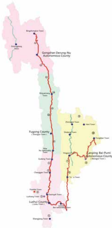
Figure 1: Location Distribution Map of Survey Villages in Nujiang

In Lanping County: No. 6-7 Lamadeng village of Tu'e Town, No.8 Lagu village of Yingpan Town, No.9-10 Renxing village of Hexi Town, No.11 Guanping village of Jinding. No.12 Xiadian village of Tongdian Town. In Gongshan County: No.13, Shandang village of Pengdang Town, No.14, Qida village of Puladi Town. In Fugong County: No. 15-16, Mujiajia village of Maji Town, No.17-18, Lishadi village of Shiyueliang Town, No. 19-20, Majiadi village of lumadeng Town, No.21, Chihengdi village of Lumadeng Town, and No.22-23, Pubai village of Zilijia Town.