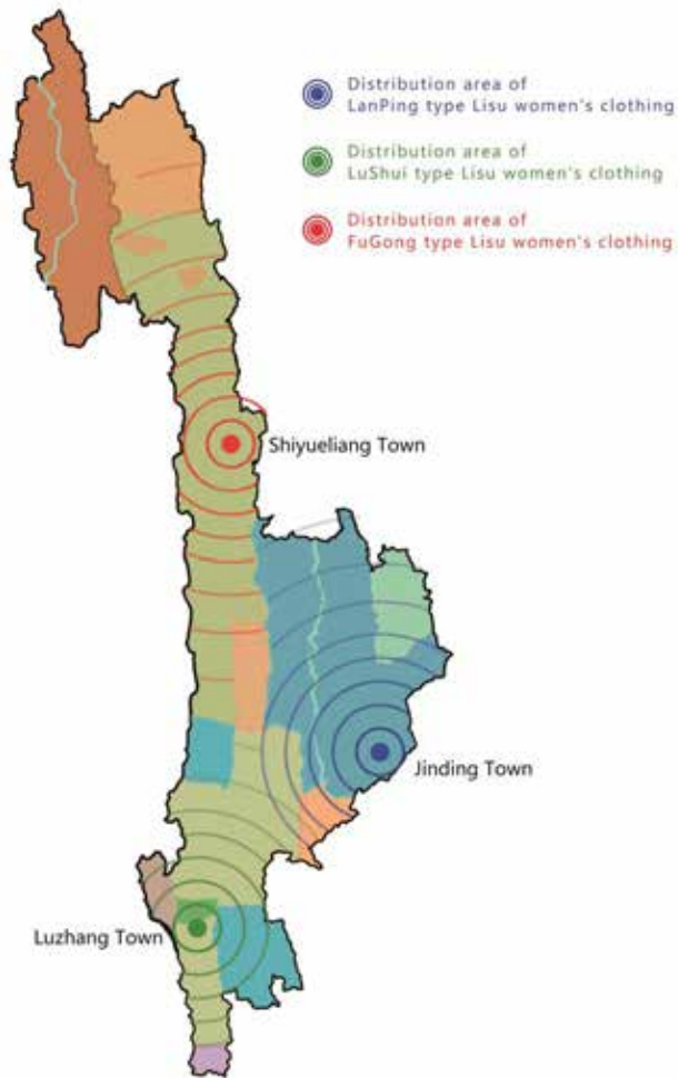
Figure 5: Regional Distributions of Lisu Women Costume Types in Nujiang Prefecture