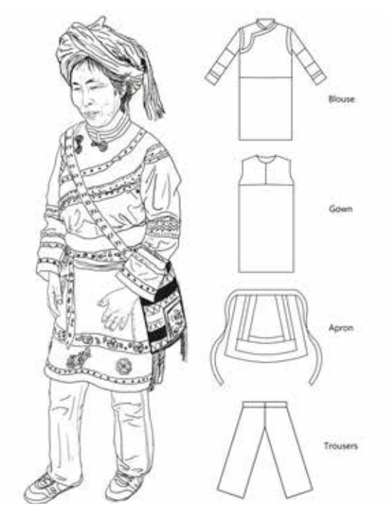
Figure 2: Lushui type portraits and pattern of Lisu costumes

Samples No. 1-6 belong to the first costume type. The costume features are as follows: wearing black headcloth or round hat; wearing a blue Blouse inside the upper body, with the right opening of top fly, long sleeves and stand collar, Hem short in front and long in back, Length front to waist, back to knee. The outer side of the Blouse is a white flax gown with no collar and sleeves, Middle Opening of top fly, Hem short in front and long in back, Length front to chest, back to leg or lower more. The lower part of the body is wearing black trousers with cotton fabric; and covered with a black apron outside. Since most samples from No.1-6 are from Lushui County, they are called as "Lushui-type of Lisu costumes" (Figure 2).