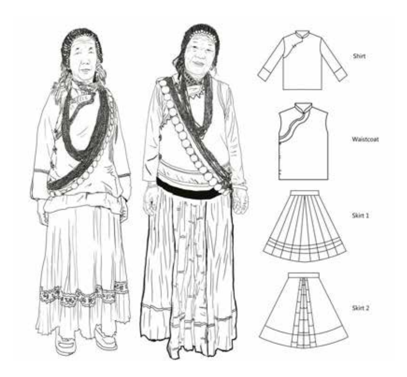
Figure 4: Fugong Type Portraits and Pattern of Lisu costumes

characteristics of the second style are: The upper part of the body is wearing a velvet Waist, with the right opening of top fly, Stand Collar and no sleeves; the lower part is a long black velvet skirt, long sleeveless and small collar; the lower body is wearing a black velvet long skirt. Most of the samples from No. 13-23 belong to Fugong County and its northern areas. Although the samples from No. 13-14 belong to the Gongshan County, nevertheless, there are frequent exchanges between the local and Fugong area, so we generally call them 'Fugong type of Lisu costumes' (Figure 4).