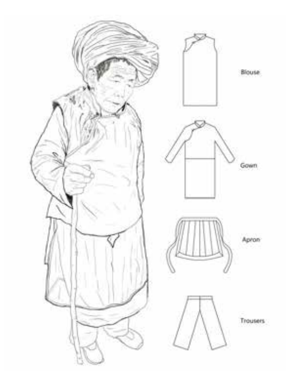
Figure 3: Lanping Type Portraits and Pattern of Lisu costumes

Samples No. 7-12 belong to the second costume type. The costume features are as follows: wearing black headcloth or black/blue Service hat; wearing a blue Blouse inside the upper body, with the right opening of top fly, no sleeves and stand collar, Hem length to knee in front and back. The outer side of the Blouse is a black or blue gown with stand collar and long sleeves, right opening of top fly, Hem short in front and long in back, length front to waist, back to knee. The lower part of the body is wearing black trousers with cotton fabric; and covered with a black cotton apron outside. Since most samples from No. 7-12 are from Lanping County, they are called as "Lanping type of Lisu costumes" (Figure 3).