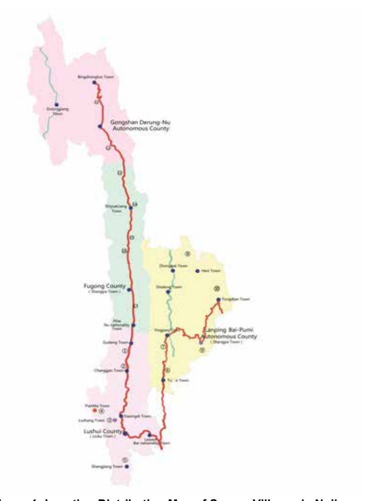
Figure 1: Location Distribution Map of Survey Villages in Nujiang

In Lanping County: No. 6-7 Lamadeng village of Tu'e Town, No.8 Lagu village of Yingpan Town, No.9-10 Renxing village of Hexi Town, No.11 Guanping village of Jinding. No.12 Xiadian village of Tongdian Town. In Gongshan County: No.13, Shandang village of Pengdang Town, No.14, Qida village of Puladi Town. In Fugong County: No. 15-16, Mujiajia village of Maji Town, No.17-18, Lishadi village of Shiyueliang Town, No. 19-20, Majiadi village of lumadeng Town, No.21, Chihengdi village of Lumadeng Town, and No.22-23, Pubai village of Zilijia Town.