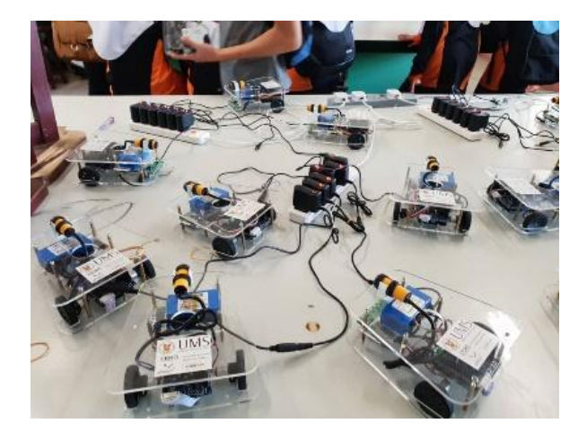
Figure 1: The Minimalist Robots 'Comel' that Are Used Throughout the Minimalist Robot Education Programme